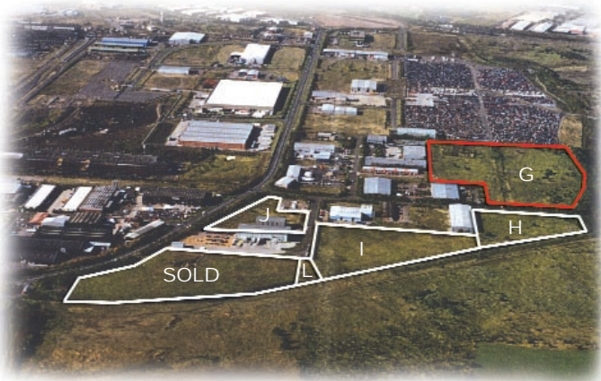
Aerial photograph of - Willowbrook Industrial Estate